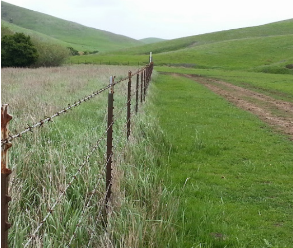
Photo P3.1 Mowing fence lines allows for easy access for repairs and maintenance.

linking to an alternative water source, consult the experts. Any piping crossing streams must be buried, and trenching associated with this must be a minimum of three feet deep to ensure that scour does not eventually reach the surface of the pipeline (NRCS 2007). In general, increasing the number of places livestock have access to water reduces overgrazing near one water source (Bush 2006).