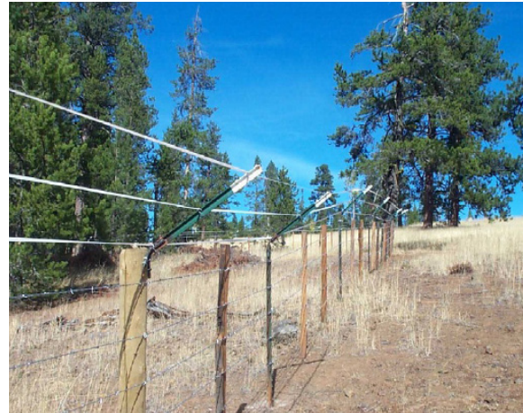
Photo P3.2 Vehicle access along livestock fencing.

destruction can occur during installation. Livestock also risk entanglement and injury on fencing as they move to get closer to water sources and desirable vegetation. All of these issues should be anticipated during the planning and advance analysis phases, but ongoing monitoring of the fencing is also necessary to detect any damage to the fence that could lead to these negative outcomes. Wildlife-friendly fencing is available to protect wildlife movement patterns. These fences are designed with smooth bottom wires and are placed an adequate distance from the ground to allow small animals to move under the fence freely (Bush 2006). Fencing with wire strands closer together prevents cattle and larger animals from pushing their heads through to reach vegetation, avoiding potential entanglement.