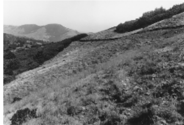
FIGURE 7.5 A stand of coastal prairie within a scrub-grassland mosaic in Humboldt Co.

Undoubtedly, Native Californians were the first to describe, recognize, interact with, and manage California's coastal prairie. Village and shell mound sites are frequently found adjacent to remaining coastal prairie areas and, interestingly, appear correlated with the most intact remaining examples of this habitat type. What little was recorded of Native Californian ethnobotany provides a long list of important species from coastal prairie (Stodder 1986). Indeed, the extensive management by these peoples is probably responsible for maintaining most large areas of grassland along the coast up to the time of contact with Old World Peoples (Gordon 1985). Because of the rapidity of their conquest, no detailed account remains describing the uses and management of this habitat type.