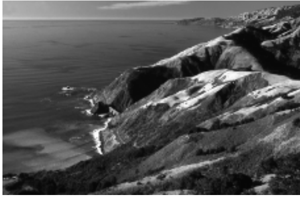
FIGURE 7.1 Mosaic of northern coastal scrub and coastal prairie at the Landels-Hill Big Creek Reserve along the Big Sur coast.

the Franciscan, Lucian, and Diablan divisions of Axelrod's (1978, 1118) "northern coastal sage," which transitions to the Venturan division within the "southern coastal sage." In Central California the northern and southern types commonly occur adjacent to each other at edaphic and microclimatic ecotones in the Central Coast Ranges.